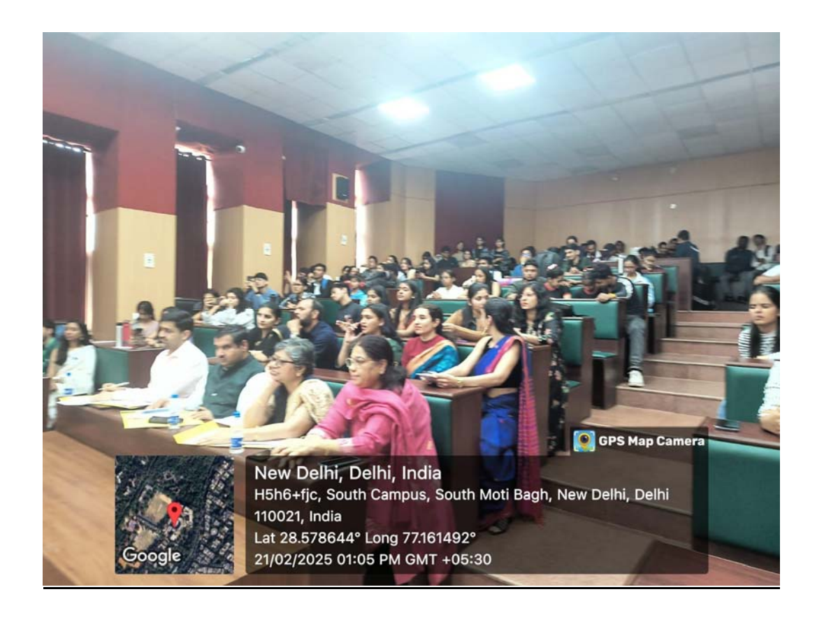
Amphitheatre during the event