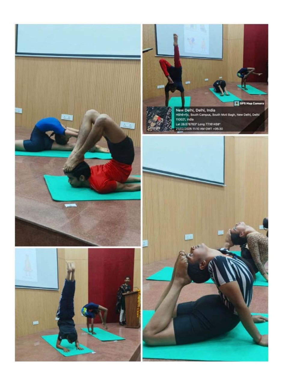
Mudra – Traditional Yogasana Competition