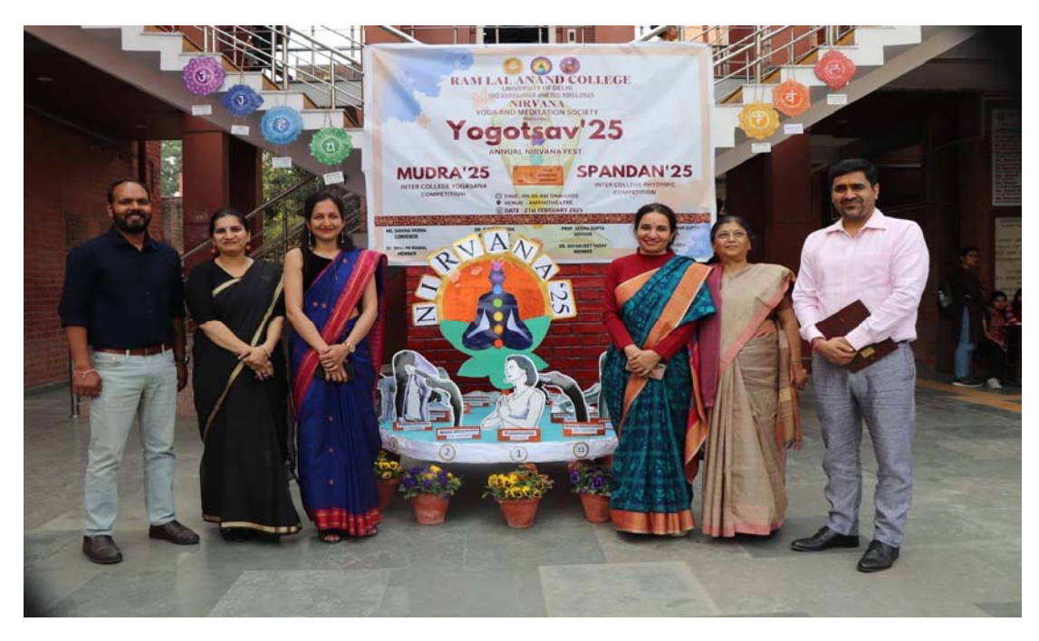
Faculty members with guests.

such events in the future to encourage the practice of yoga and overall well-being among students.