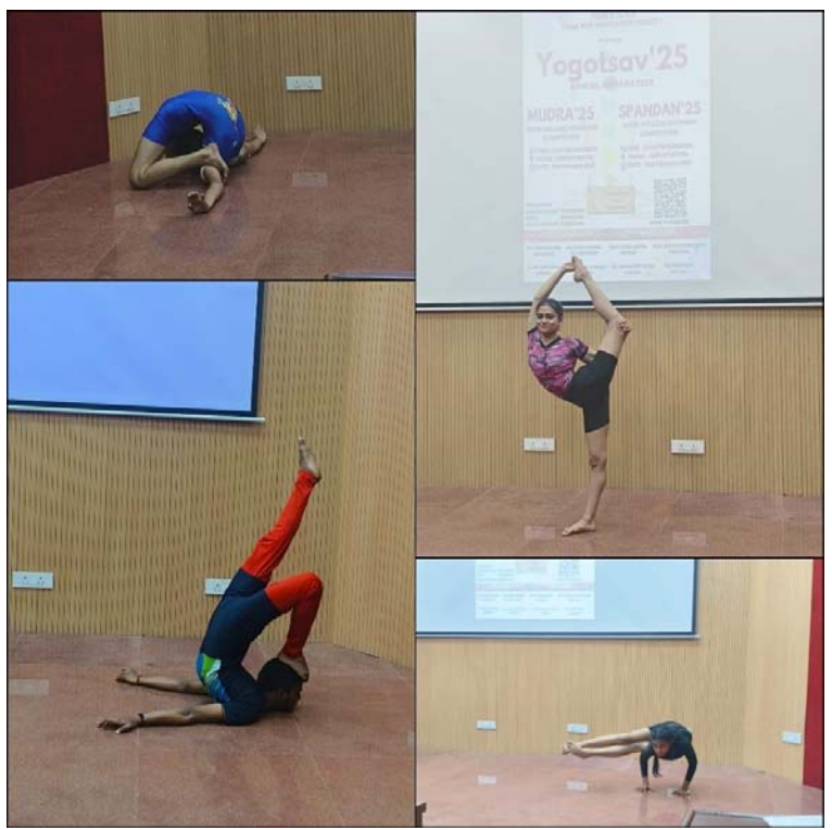
Spandan – Rhythmic Yoga Competition