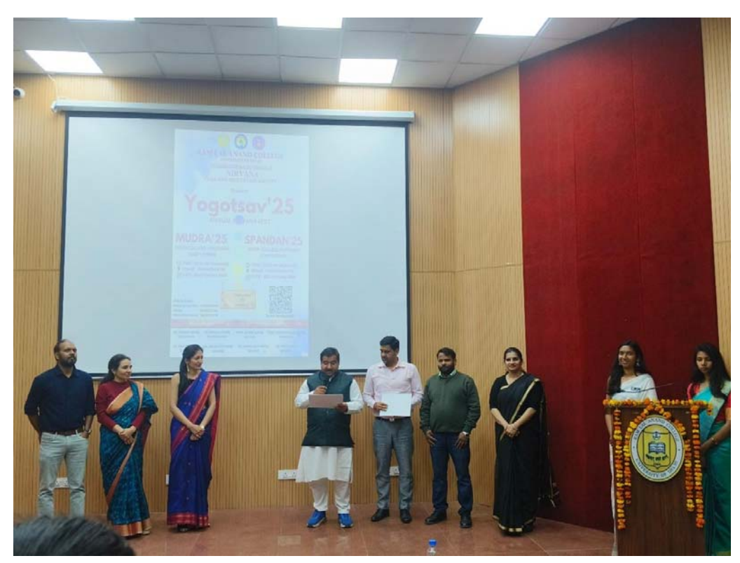
Announcement of the winners